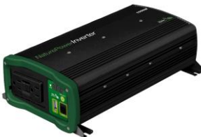
38310 - Inverter 12V 1000W