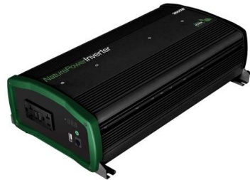
True Sinewave Series

For safe and optimum performance, the Power Inverter must be used properly. Carefully read and follow all instructions and guidelines in this manual and give special attention to the CAUTION and WARNING statements.