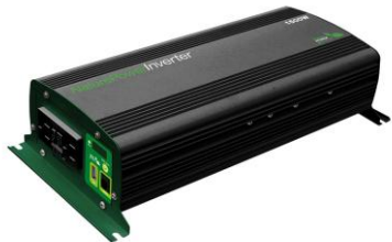
38215 - Inverter 12V 1500W