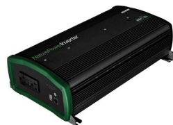
38320 - Inverter 12V 2000W