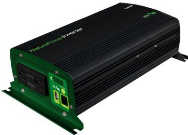
Modified Sinewave Series